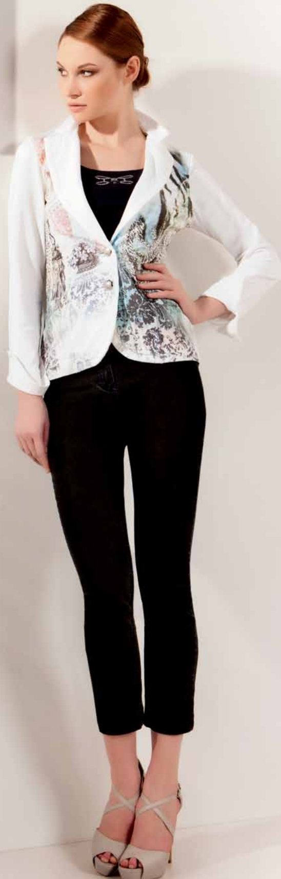
Jacket: NATY-PRI 2244 100 Tank top: LODGE-SEC 2234 338 7/8 jeggings: FRASE 4532 535