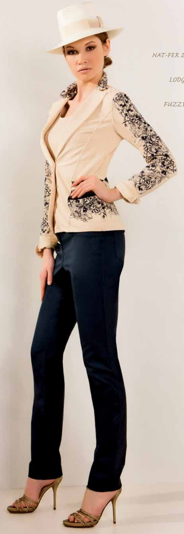
Jacket: NAT-FER 2244S 21338 Tank top: LODGE 2234 219 Jeggings: FUZZYS 4453 338